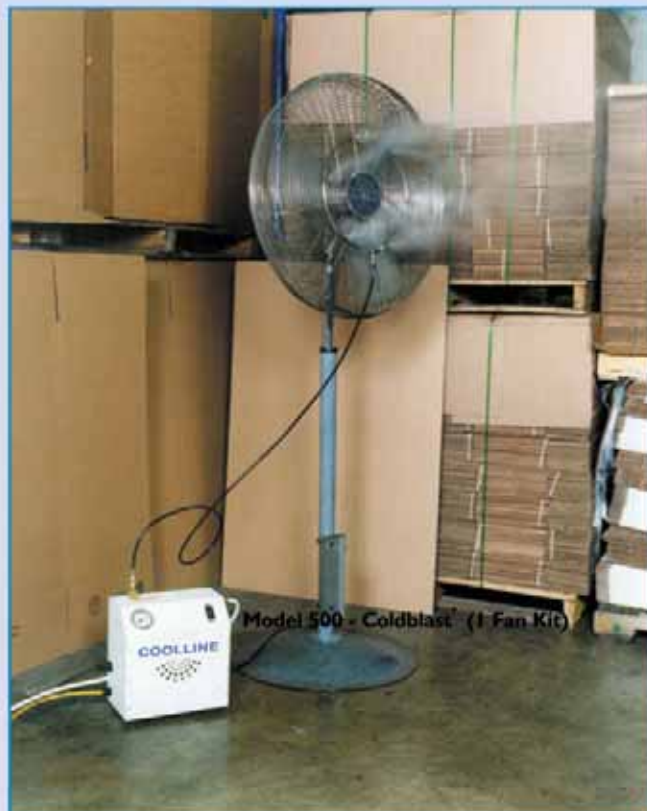
Model 500 - Coldblast® (1 Fan Kit)