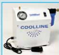
Coldblast .5 GPM Pump Module