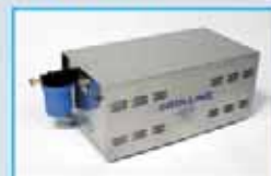
Coldblast 1 GPM Pump Module